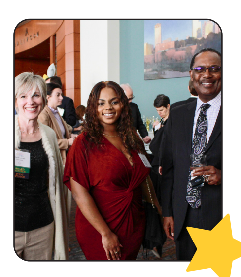
STARS OF ED 2022